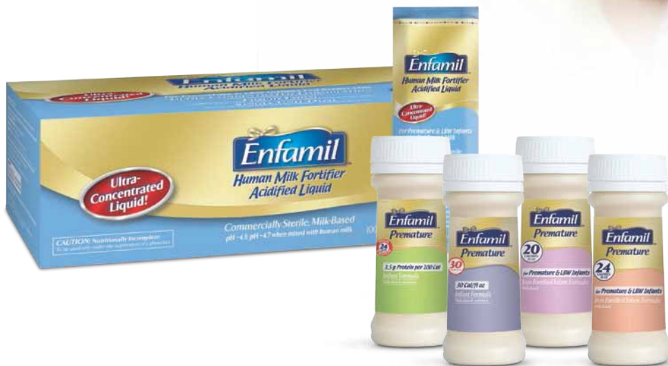
Enfamil Premature Hospital Nutrition