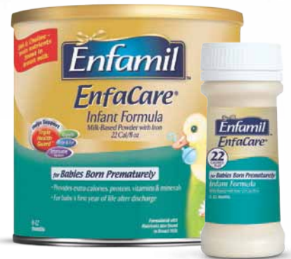
Enfamil Premature Post-discharge Nutrition

*vs control discontinued Enfamil formulas without DHA and ARA (formula-fed infants) and vs Enfamil powder HMF (breastfed infants)