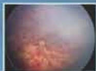
Image of Macular Hemorrhage