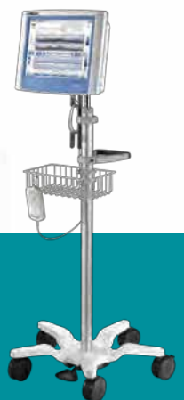
CFM Olympic Brainz Monitor