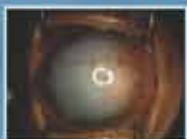
Image of Congenital Glaucoma