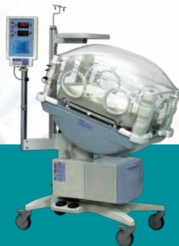
NatalCareLX Infant Incubator