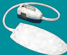
neoBLUE® blanket LED Phototherapy System

To learn more and enter to win a neoBLUE blanket LED Phototherapy System, visit www.natus.com/neoblueblanket