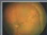
Image of Retinopathy of Prematurity