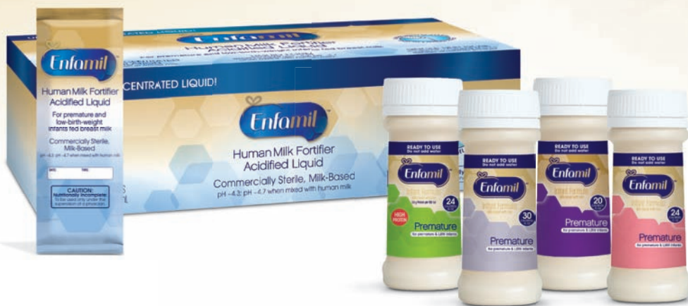
Enfamil Premature Hospital Nutrition