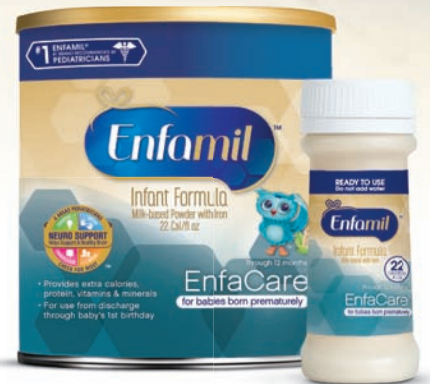
Enfamil Premature Post-discharge Nutrition

*vs control discontinued Enfamil formulas without DHA and ARA (formula-fed infants) and vs Enfamil powder HMF (breastfed infants)