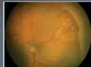
Image of Retinopathy of Prematurity