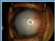
Image of Congenital Glaucoma