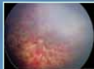
Image of Macular Hemorrhage