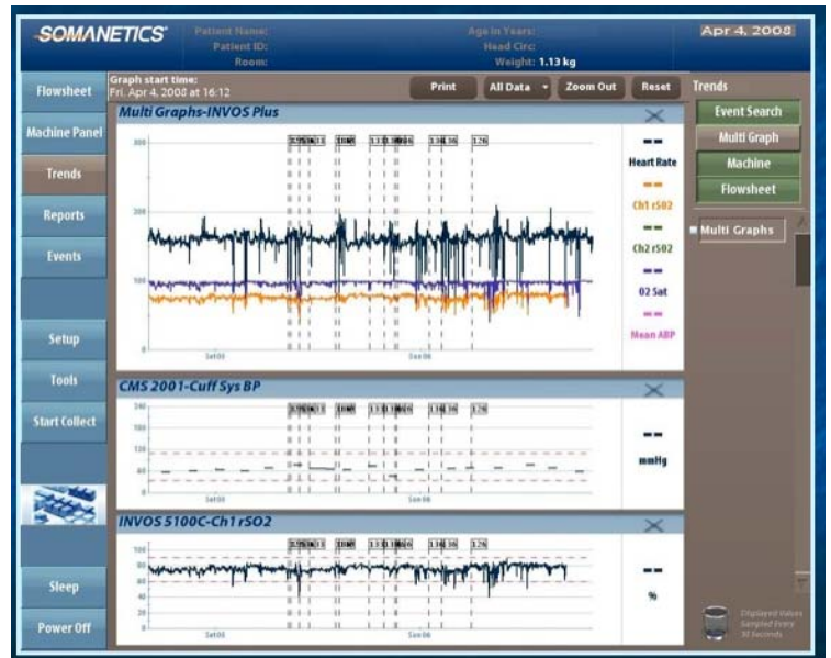
Figure 3a - Case 4; Twin A: Overview of study. Twin A, born by C-section, 9/9 Apgars. Infant was having many episodes of bradycardia, some of which were associated with acute decline in cerebral oxygenation, indicating instability of cerebral autoregulation. Ultimately both twins were diagnosed with gastroesophageal reflux.

Figure 3a shows an overview of the entire study that is remarkable for many "apnea and bradycardia" episodes, most associated with close coupling of peripheral and cerebral desaturations, indicating poor cerebral autoregulation; Figure 3b shows a zoomed-in close-up of a major "A&B" episode, with normal blood pressure and marked simultaneous decrease of cerebral mixed venous oxygenation. These findings indicate