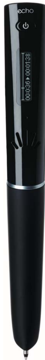
Actual size shown (6.22" x 0.78" at top; 0.45" at tip)

How: Start or change your free subscription to Neonatology Today from print to the PDF.