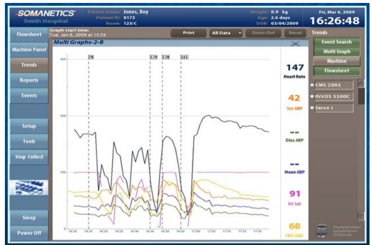
Figure 8 - Case 2: Perforated NEC: Close up of the fentanyl-induced post-operative "Code" episode. The drastic destabilizations of all physiologic parameters during this 35 minute long resuscitative attempt are very obvious. Equally marked is the nearly immediate normalization of the baby's condition after the Narcan administration (Event 161). Also note the probable acute cerebral over-circulation (yellow trace) after the code episode ended. By the second post-operative day, the baby had recovered cerebral autoregulatory control. Events: 78-Sedation with fentanyl; 126-Suction ET tube; 129-Intubated/Extubated; 138-Cardiac Arrest/CPR.

The attending was stat paged by the senior fellow to the difficult code scene. Remembering the poor tolerance to fentanyl in the OR, the key question became, "Did anybody just give this baby a dose of fentanyl?" A quick check with nursing and pharmacy confirmed that the baby was given a routine post-operative fentanyl dose as part of a pathway order-set for post-operative pain control, just before the episode began. An emergency dose of narcan was administered (Event 161), and the baby recovered and stabilized within 2-3 minutes.