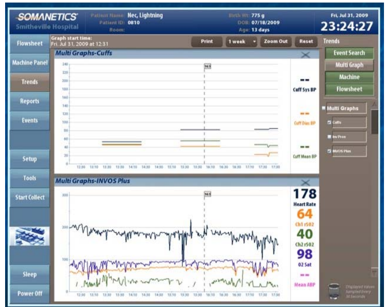
Fig 5b - Case 10: Lightning NEC with acute loss of cerebral autoregulation; the final five hours of Case 10's twenty-four hour study, expanded on the timeline. Good cerebral autoregulation is seen on the left side of the tracing. Acute loss of cerebral autoregulation is indicated by new onset of 'pressure-passive' cerebral oxygen saturation on the right side of the tracing. Prior to that, the baby tolerated peripheral desaturation episodes with no associated cerebral deoxygenation. Loss of cerebral autoregulatory capability occurred over 75 minutes, while the baby "crashed" with hypotension, acute respiratory deterioration and disseminated coagulopathy. The timeline is artificially offset by several hours, as a pictorial deidentifying adjustment. Event 163-KCl infusion.

The persistent cuff blood pressure drop earlier in the day, with widening of pulse pressure between the times "Monday 1800 to mid-night" is visible in the retrospective trended overview (Figure 5a). The change may have represented reopening of a ductus arteriosus, possibly cytokine-induced. A reopened ductus would increase left-to-right pulmonary shunting, with an associated decline in intestinal blood flow, especially in an infant with normal lungs and pulmonary circulation. The actual cuff blood pressure values were charted on the paper flowsheet, but the retrospective diagnosis of new ductal shunting was not appreciated in real-time; feeding continued, and the ensuing events show the pathophysiology of evolving NEC-related sepsis in a premature infant.