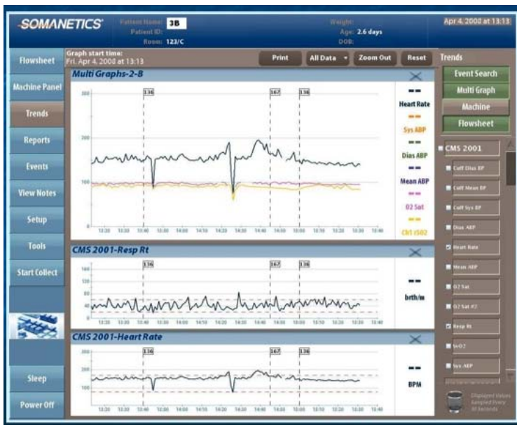
Figure 4b - Case 3: Twin B: Close-up of poor autoregulation associated with some, but not all bradycardiac spells, without apnea. The baby's ability to autoregulate cerebral oxygenation during bradycardia-induced fall in peripheral oxygenation was poor. Events: 136-Apnea & Bradycardia; 167-PIV Insertion.

“The concept of ‘Cerebral Autoregulation’ is based on many animal and human research studies showing that healthy brains will adjust vascular resistance using many different cellular and neurologic reflexes, to maintain constant tissue oxygenation over wide ranges of perfusion pressure, blood oxygen and carbon dioxide concentrations 1, 2 .”