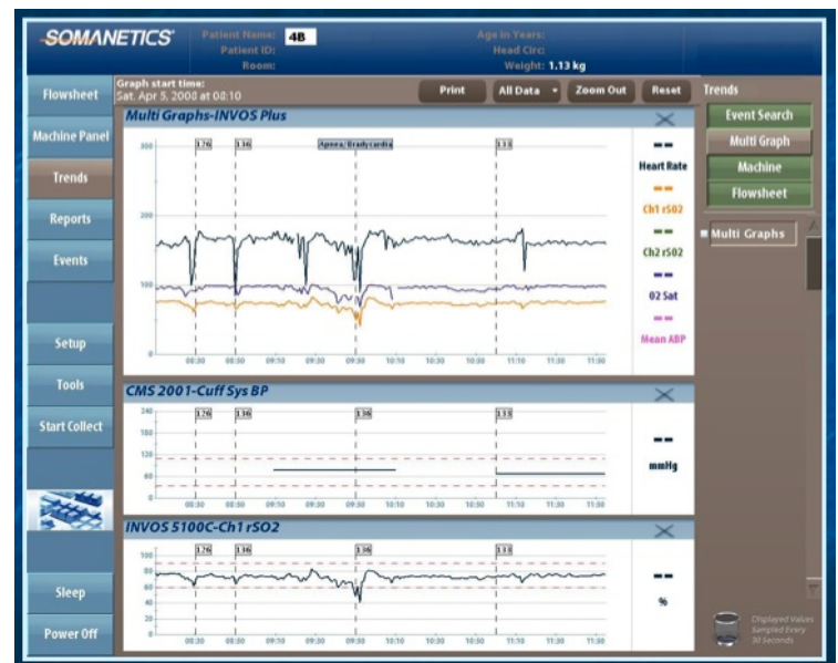
Figure 3b - Case 4, Twin A: "A & Bs" with unstable cerebral autoregulation. Zoomed-in view of a few desaturation episodes associated with several events: 126, Suction ET tube; 136, A&B; and, 133, Bag/mask ventilation.

the baby at 30 weeks post-conceptual age had poor cerebral autoregulation, even at "normal" blood pressure, despite having no PDA on echocardiography, or any known systemic illness. These findings may simply represent developmental immaturity; or may relate to some interaction with caffeine, coupled with the premature response to gastroesophageal reflux, an autosomal dominant genetic condition that was later confirmed in both twins.