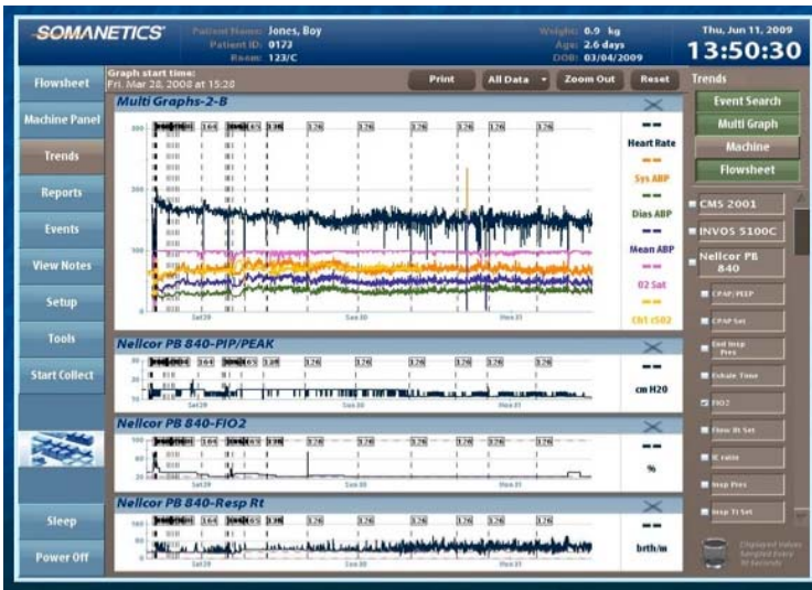
Figure 7 - Case 2: Perforated NEC: Overview of the 48 hour post-operative study, after the baby was returned to the NICU and Vital Sync monitoring of multiple parameters was started. The 35 minute "code" episode is the blurred vertical bar on the far left side. Note that cerebral autoregulation (yellow line) was unstable for about 18 hours (see Figure 8) after the code episode. Subsequently the baby regained cerebral autoregulation, which was stable over the final 24 hours of the study.

that affected cerebral oxygenation, including respiratory problems associated with fentanyl dosing that required pre-operative hand ventilation for several minutes before restabilization on the ventilator. The baby had multiple episodes of peripheral hyper-oxygenation and hypoxemia, bowel manipulation, normal saline boluses, blood administration, and an acute endotracheal tube obstruction due to kinking during the patient transfer from the operating table to the transport warmer bed.