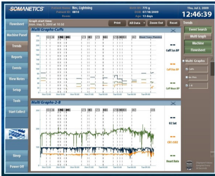
Figure 5a - Case 10: "Lightning NEC:" 24 hour overview of a 27 week, SGA baby developing "Lightning NEC" over about 90 minutes, 10 hours after graphic trend review suggested that a PDA reopened near Event 173-Nothing Charted. The trend view of the cuff blood pressures shows the systolic, diastolic and mean blood pressure dropped about 40% while the baby had a HCT of 19%. A routine packed red cell transfusion was given for the anemia, starting at 0220, near the beginning of an acute destabilization episode diagnosed as severe NEC by a 0400 abdominal x-ray. Events: 43-enteral feeding; 136-A & Bs, 163-KCl infusion; 173-nothing charted; 182-Suction + X-ray.

Sync trends with INVOS running in real-time. Figure 5a, is a 24-hour study overview and includes the acute destabilization period, starting 0300 with tachycardia. The tachycardia was followed by worsening peripheral arterial desaturations, progressive increase in regional cerebral oximetry starting at about 0600. Right panel (Figure 5b) "zooms in" on the final 5 hours of the study, to show acute loss of previously good cerebral autoregulation over about 70 minutes. The baby's capillary PaCO 2 changed from 40mmHg at 0530 to >130 mmHg by capillary gas, on a ventilator, by 1155. The large PaCO 2 change would have had profound effect on cerebral circulatory control.