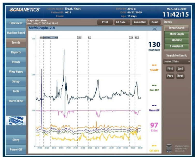
Figure 2 - Case 11: Congenital cardiomyopathy. Close-up of this baby's pattern associated with endotracheal suctioning. Findings are tachycardia, acute peripheral desaturation, and no consistent associated change in the preexisting low, fixed cerebral oxygenation. The single identified discrete improvement occurred during a family visit, with chest to chest semi-upright holding. Event markers: 41-Miscellaneous; 176-Family Visit.