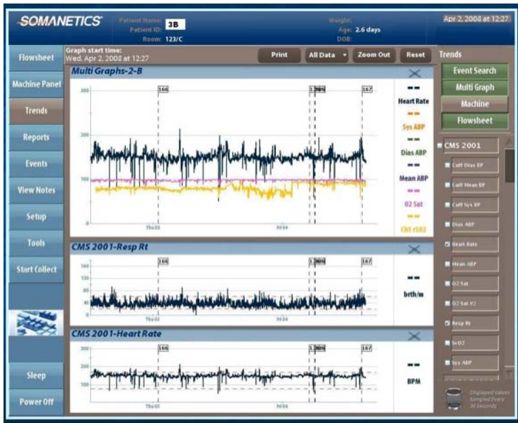
Figure 4a - Case 3: Twin B: Overview of entire study, initially showing reasonable cerebral oxygenation stability. The step change in cerebral oxygenation occurred with a care episode, and may reflect either an artifact, or readjustment of CPAP apparatus that may have changed cerebral vascular dynamics, perhaps by relieving cavernous sinus pressure. Events: 166-Caffeine load; 167-PIV insertion.