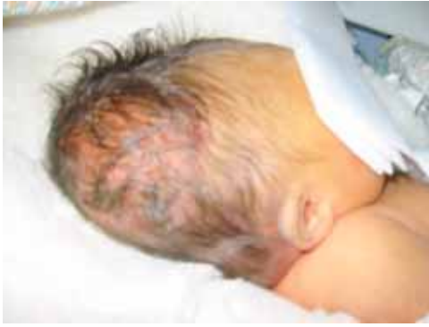
Figure 5. This is a picture of a 3-day-old term newborn infant following vacuum extraction delivery at a community hospital. Vacuum was applied 6 times with several pop-offs. Note generalized jaundice and elongated head with the evidence of gravity dependent extra cranial fluid. At the time of admission to our NICU, 6 hours of life, infant's Hematocrit was 31%. Transfusion of packed RBCs, 15 ml/Kg, was carried out soon after admission. There was neither blood group incompatibility nor intracranial hemorrhage. At 4 years of age, the child is healthy. (Written signed permission from the child parents was obtained).

ery, is associated with significant neonatal morbidity and mortality. Early recognition of SGH and the institution of supportive care such as blood transfusion, volume support, and coagulation factors, in the presence of DIC, are useful and indicated. Palliative treatment such as head wrapping has limited value. Early recognition and treatment of SGH is critical. Serial observations for neonatal scalp changes, as described above, signs of pallor, anemia, metabolic acidosis and hypovolemia are recommended after vacuum-assisted deliveries.